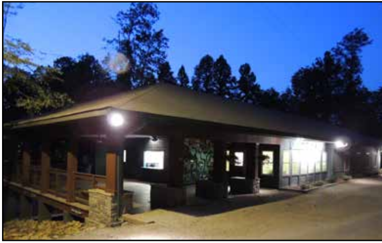
Bernie & Billi Marcus Health Center at CBM